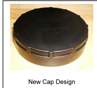
New Cap Design