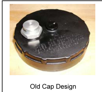
Old Cap Design

Figure 2 – The NEW cap design is simplified and is vented through the threads rather than on top. This improvement will help prevent debris from accumulating in the reservoir and contaminating the anti-spatter liquid.